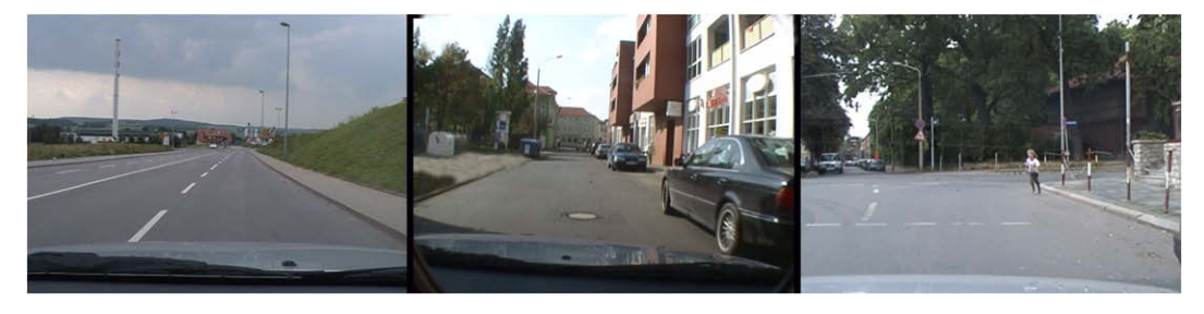
Fig. 1. Examples for traffic scenes used in the present study. From left to right, these represent an example of a low, medium, and high braking affordance traffic scene.

In the pictures depicting medium and high affordance scenes, rectangular regions were drawn around the potential hazard (see Fig. 2). It was ensured that the overall mean size of these hazard regions as well as their spatial distance from the preceding fixation cross (see below) did not differ between both categories.