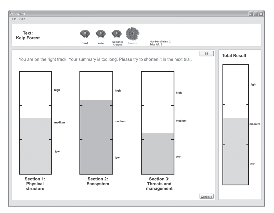
Figure 2. Screenshot of the feedback page of conText . The program displays a bar chart for each section of the source text, as well as the total result. Above the charts, a short verbal feedback is given. At the top, the program indicates the current position within the training cycle, as well as the remaining trials.

into the regular course by using schoolbook texts from the domains of biology, geography and history. The texts were approximately 150 words long (see Table 1). Students received a new text each session, except in cases where the texts turned out to be difficult and the teacher decided to complete the unfinished work of the last session.